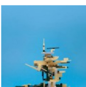
Foster + Partners