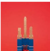
DSDHA