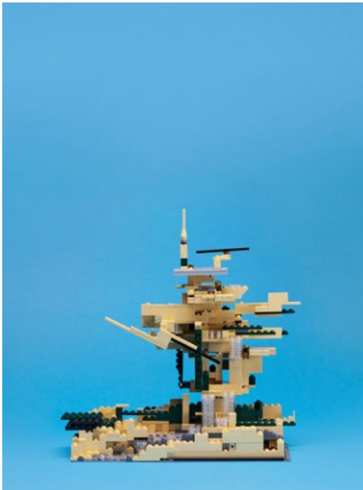
Foster + Partners

Each firm used a stock architectural Lego kit of their chosen building and reinterpreted it in a quick model building session, resulting in unique and playful creations. Atmos Studio chose Frank Lloyd Wright's Fallingwater , and chose to bake their final construction for 20 minutes until it began to melt back into its native state. Foster + Partners chose the Empire State Building in addition to the Fallingwater kit. In a mix-mash creation, they turned the Empire State building upside down to create shadowed spaces with hanging gardens, and managed to utilize all the Lego pieces from both kits. Other interesting interpretations included Adjaye Associate's reinterpretation of the White House. They retained the iconic façade, relocated all government activity underground, and opened up the ground level for the public.