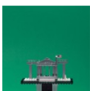
Adjaye Associates