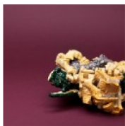
Atmos Studio

These sketch models are reminiscent of the playfulness and simplicity that many of us experienced as children as we played with Lego, unconfined by the boundaries of building codes and convention.