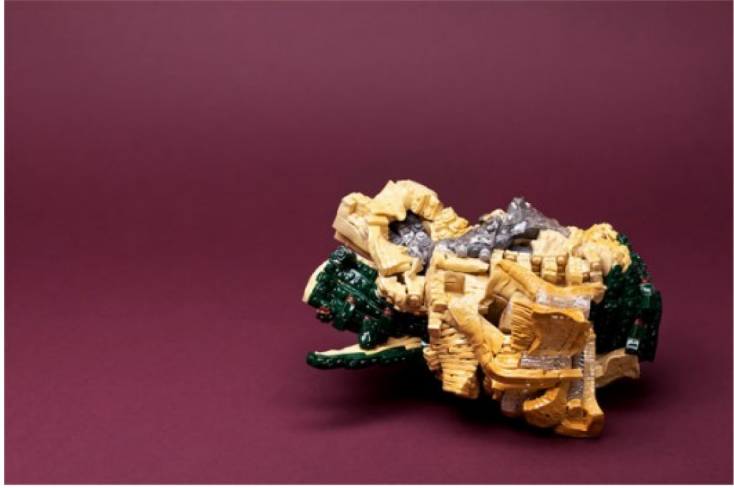
Atmos Studio

Do you remember playing with Lego as a child? Recently the firms Atmos Studio , Make , Foster + Partners , AOC , Adjaye Associates , FAT and DSDHA took some time out from designing real buildings to create their own interpretation of some of the world's most notable architectural icons in the form of Lego for an Icon Eye initiative.