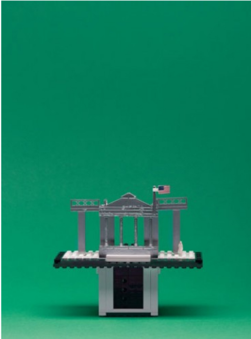
Adjaye Associates

Do you remember playing with Lego as a child? Recently the firms Atmos Studio , Make , Foster + Partners , AOC , Adjaye Associates , FAT and DSDHA took some time out from designing real buildings to create their own interpretation of some of the world's most notable architectural icons in the form of Lego for an Icon Eye initiative.