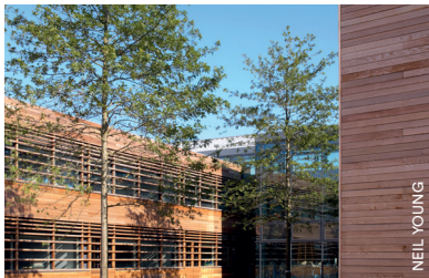
3 WEST LONDON ACADEMY (2006) Architect: Foster + Partners Address: Bengarht Road, Northolt, London, UB5 5LQ Info: www.fosterandpartners.com