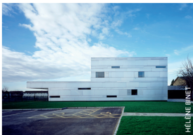
4 WILLIAM BELLAMY PRIMARY SCHOOL (2006) Architect: DSDHA Address: Frizlands Lane, Dagenham, RM10 7HX Info: www.dsdha.co.uk