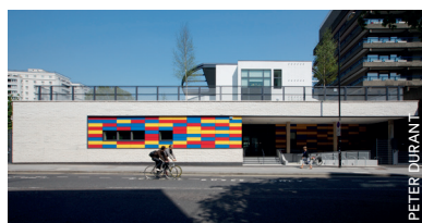
10 GOLDEN LANE CAMPUS (2008) Architect: Nicholas Hare Architects Address: Golden Lane Campus, 101 Whitecross Street, London, EC1Y 8JA Info: www.nicholashare.co.uk