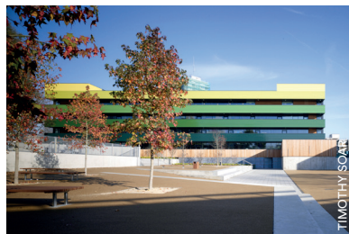
8 WESTMINSTER ACADEMY (2007) Architect: AHMM Address: The Naim Dangoor Centre, 255 Harrow Road, London, W2 5EZ Info: www.ahmm.co.uk