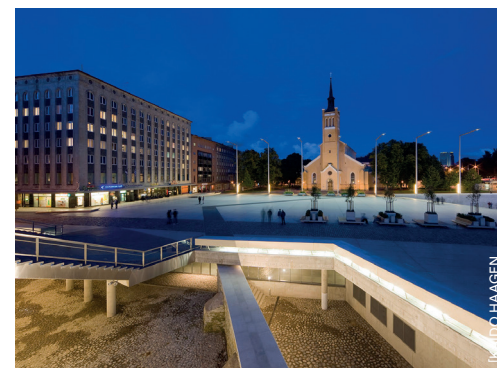
↑ Liberty Square by Alver Architects, 2009

What happened after the famous Tallinn Ten changed the face of architecture in Estonia in the 1980s? Guest-editor and dedicated A10 correspondent Triin Ojari, director of the Museum of Estonian Architecture, reflects on the situation after the crisis. How does the up-and-coming generation of architects redefine the role of the architect? In what way is the quality of public space a crucial issue in the contemporary city of information flows? And how can Russian cultural heritage be best dealt with, now that the Russian presence at the country's borders is looming once more, despite the nation's independence since 1991?