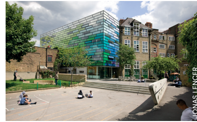
11 CLAPHAM MANOR PRIMARY SCHOOL (2009) Architect: dRMM Architects Address: Belmont Road, London, SW4 0BZ Info: www.drmm.co.uk