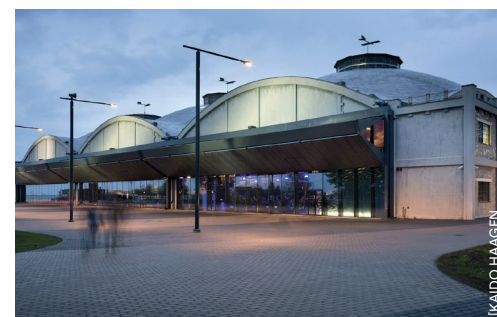
↑ Estonian Maritime Museum by KOKO, 2012

Under 40, but with a lot of experience. KOKO's debut at Expo Hannover in 2000 with a perpetuum mobile pavilion set their career in motion in Estonia. Since then, they have wisely escaped the shopping malls and office blocks that came with Estonian building boom and focused on the transformation of cultural heritage and housing. Now they have won the Young Estonian Architect Award. So what's next? And what's that little door in the kitchen of their office?