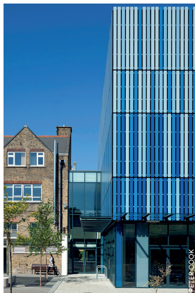
9 ADDEY & STANHOPE SCHOOL (2010) Architect: HKR Architects Address: 472 New Cross Road, London, SE14 6TJ Info: www.hkrarchitects.com