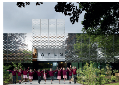
15 THE HAYES PRIMARY SCHOOL (2014) Architect: Hayhurst and Co. Address: 98 Hayes Lane, Kenley, Surrey, CR8 5JN Info: www.hayhurstand.co.uk