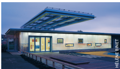
5 JOHN PERRY NURSERY AND CHILDREN'S CENTRE (2006) Architect: DSDHA Address: Auriel Avenue, Dagenham, RM10 8BS Info: www.dsdha.co.uk