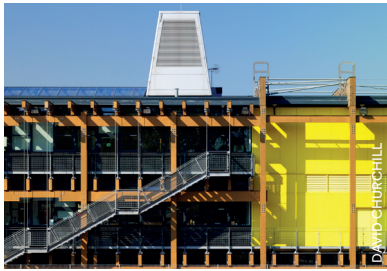
2 MOSSBOURNE COMMUNITY ACADEMY (2004) Architect: Rogers Stirk Harbour + Partners Address: O100 Downs Park Road, Hackney, London, E5 8JY Info: www.rsh-p.com