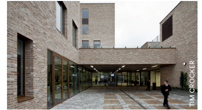
16 CHELSEA ACADEMY (2010) Architect: Feilden Clegg Bradley Studios Address: Lots Road, London, SW10 0AB Info: www.fcbstudios.com