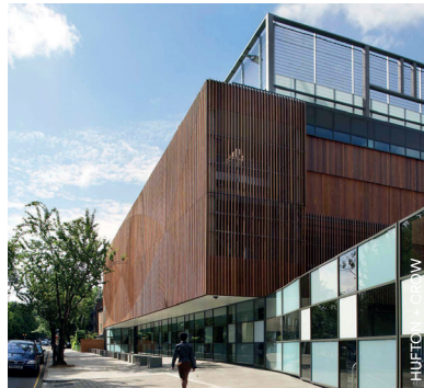
7 ST MARY MAGDALENE ACADEMY (2008) Architect: Feilden Clegg Bradley Studios Address: Liverpool Road, London, N7 8PG Info: www.fcbstudios.com