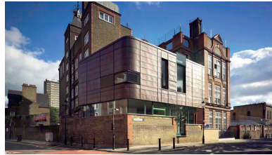
6 CHISENHALE PRIMARY SCHOOL (2007) Architect: Ryder Architecture Address: Chisenhale Road, Bow, London, E3 5QY Info: www.ryderarchitecture.com