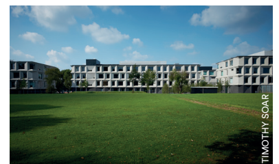
20 BURNWOOD SCHOOL (2014) Architect: AHMM Address: Burntwood Lane, London, Wandsworth, SW17 0AQ Info: www.ahmm.co.uk