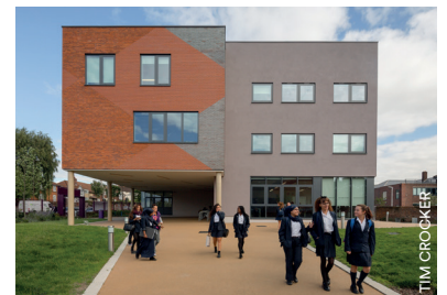
18 ELTHAM HILL SCHOOL (2013) Architect: Hawkins\Brown Address: Eltham Hill, London, SE9 5EE Info: www.hawkinsbrown.com