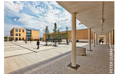
17 STATIONERS' CROWN WOODS ACADEMY (2012) Architect: Nicholas Hare Architects Address: 145 Bexley Road, Eltham, London, SE9 2PT Info: www.nicholashare.co.uk