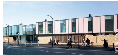
12 PHOENIX PRIMARY SCHOOL (2010) Architect: HKR Architects with John Pardey Architects Address: Marlborough Grove, London, SE1 5JT Info: www.hkrarchitects.com