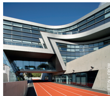
13 EVELYN GRACE ACADEMY (2010) Architect: Zaha Hadid Architects Address: 255 Shakespeare Road, London, SE24 0QN Info: www.zaha-hadid.com