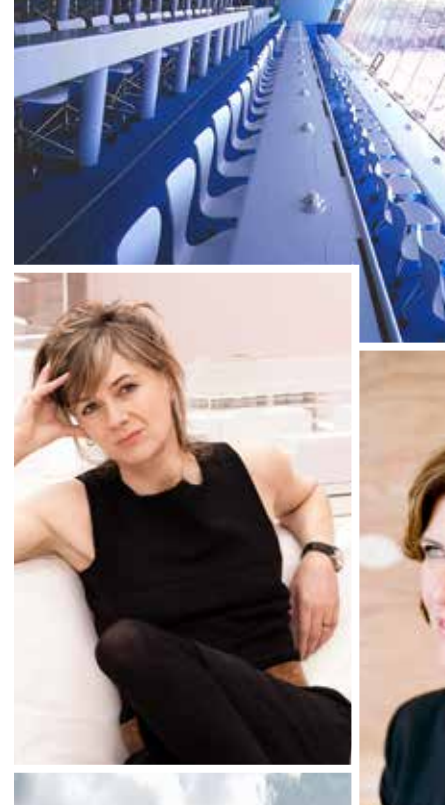
(Clockwise from the top) ARCHITECTURAL ICONS Levete's completed Media Centre at Lord's Cricket Ground. Architect Jeanne Gang. A rendering of Gang's design for the Tellapur O2, a residential complex in Hyderabad. Architect Amanda Levete.