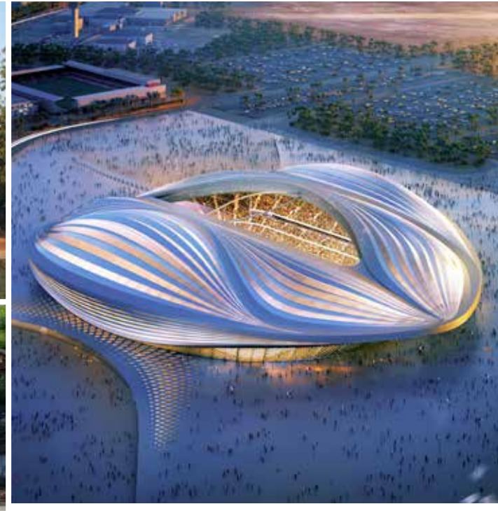
000 AD ARCHITECTURAL DIGEST MARCH-APRIL 2015

< Aga Khan jury on Heringer's handcrafted METI school, built with lashed bamboo in Rudrapur, Bangladesh. Her circular, thatched kindergarten in Zimbabwe is another example of vernacular architecture for the community that involves local craftsmen, while her ceramics museum in Lintao, China in 2015 is literally ground-breaking. "Made of rammed earth like parts of the Great Wall," she explains, "it uses the same material, clay, as its contents, which are exquisite 5,000-year-old ceramic pieces. I really wanted to show that there's a viable alternative to concrete."