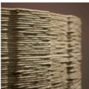
Foster + Partners works on "world's first commercial concrete-printing robot"

Edmund de Waal, also known as the author of The Hare with Amber Eyes , requested an interior with a variety of spaces, including areas for working on large-scale porcelain artworks and more intimate spaces for quiet reading or sitting at the potter's wheel.