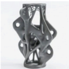
3D-printed structural components will lead to "new building shapes"