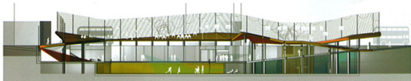
DSDHA/Atelier Saunt at EPFL